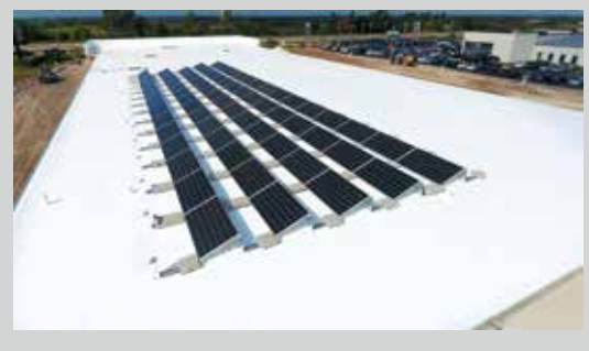
Then another company installed the solar photovoltaic system and we returned to seal the flashing.