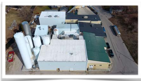
The 50,000 square foot roof of Cascade Cheese is typical of a larger project for Precision.

Ironically, a number of our most recent projects are for buildings in the food industry. Due to the great number of protrusions on those roofs and the demanding exhaust, Duro-Last material is usually specified. As a qualified Duro-Last contractor, Precision is invited to bid on projects.