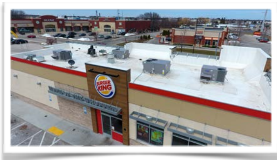
We've installed roofs on multiple Burger King locations throughout the state.

When you choose Precision for your flat roof project, you'll be among great company. Here are some of our recent projects: