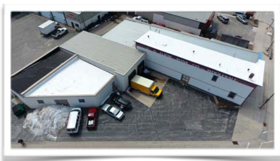
CA Flipse had a smaller 3,000 square foot roof that needed replacing.