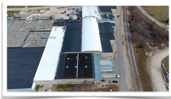
Over the course of a number of years, we've reroofed 10,000 square foot sections and larger for Lakeside Foods.